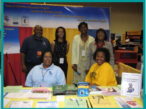
Diabetes Exhibit Table